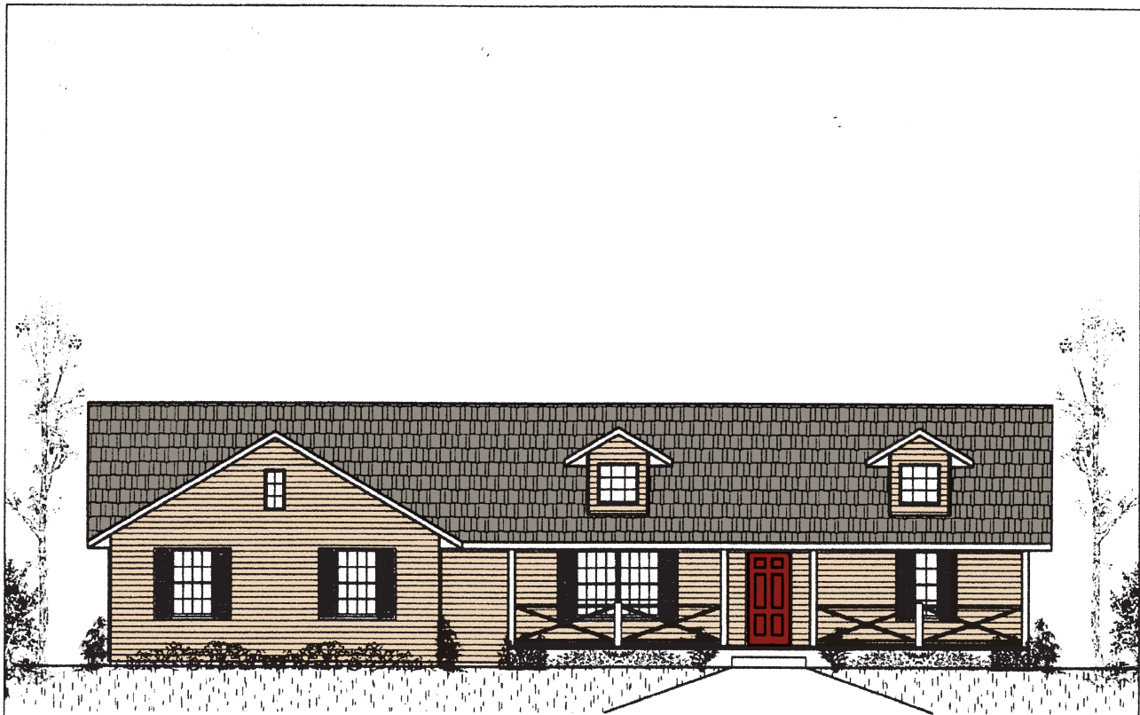
FRONT ELEVATION SCALE: 1/4"=1'-0"